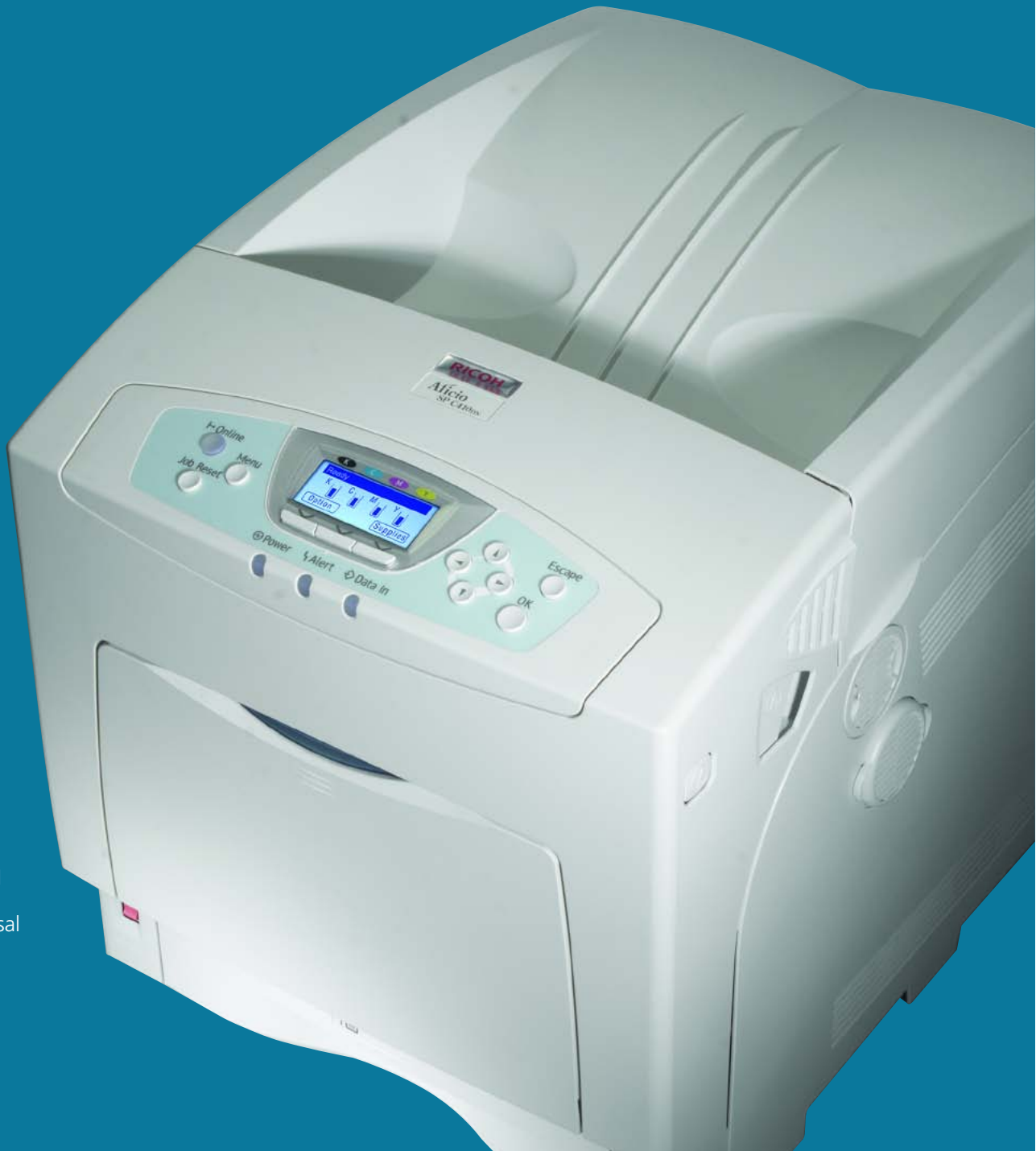
Ricoh Aficio SP C410DN standard configuration shown here with universal 550-sheet paper tray.

Making the move from black & white to color is easier than you think with the RICOH® Aficio® SP C410DN/SP C411DN Color Laser Printers. That's because they combine captivating color and affordability into systems that impress with fast print speeds, high reliability, standard two-sided automatic printing and high-yield consumables.